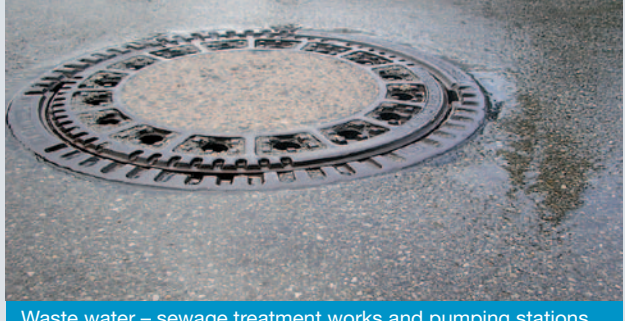
Waste water - sewage treatment works and pumping stations