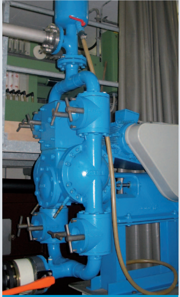
Ball valves with inspection opening and membrane leakage detection device

The technical details described below that make the ABEL Compact Membrane Pumps so unparalleled in function and quality.