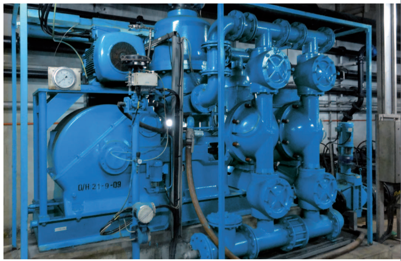
ABEL CM piston membrane pumps for raw sewage transfer in a large WWTP in Asia

ABEL CM piston membrane pumps are single or doubleaction specialized pumps that are used for difficult media. They are highly resistant to wear, even when used at high pressures over an extended period of time. Their true double-membrane technology offers a high degree of safety.