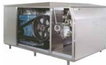
Transmission (Power End)

We will be happy to discuss any other requirements you may have.