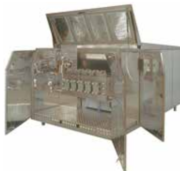
Access to the Homogenizing