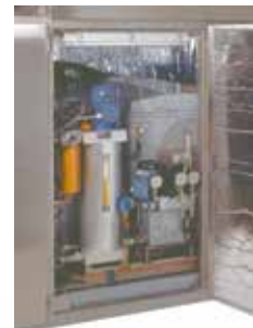
Oil and Hydraulic Units