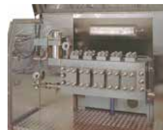
Liquid End (Gaulin)