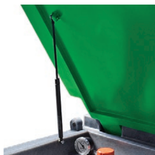
Lid with gas spring