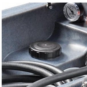
large 4“ filling port