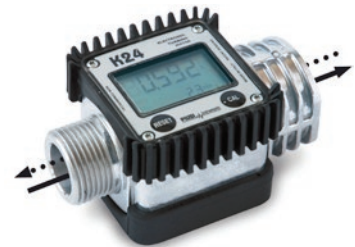
digital flow meter K24