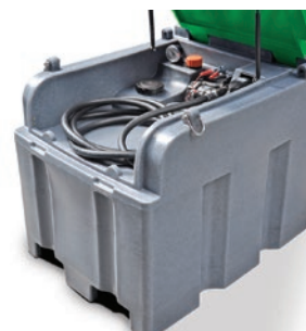
large tank interior