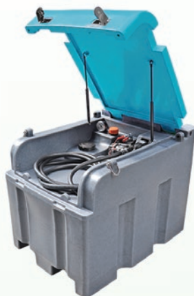
Mobile Tank for AdBlue 400l