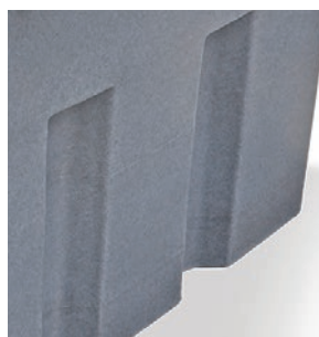
particularly robust tank wall