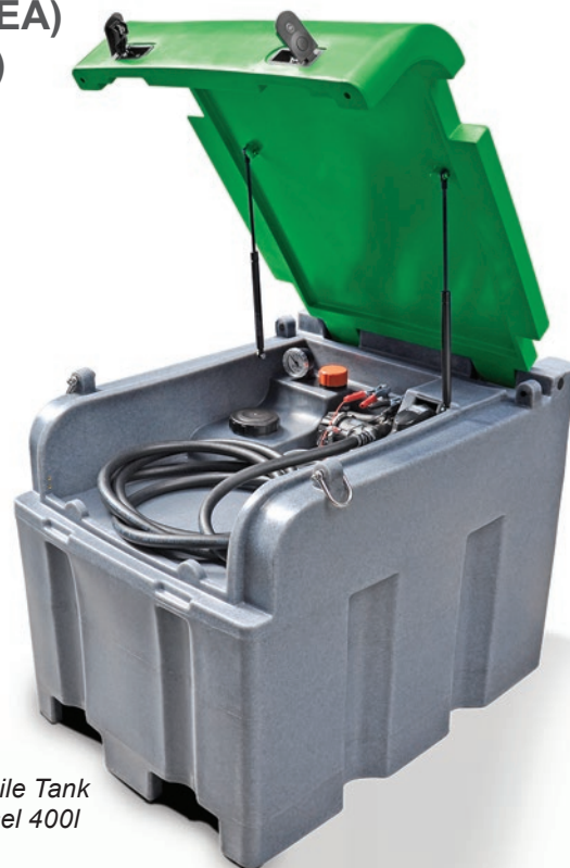
Mobile Tank Diesel 400l