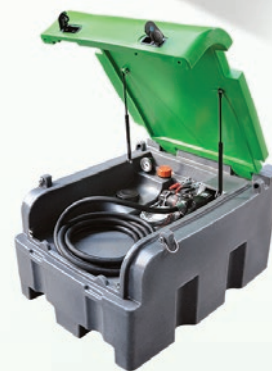
Mobile Tank Diesel 200l