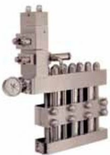
RANNIE THREE-PIECE VALVE HOUSING