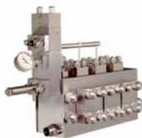
GAULIN MONO-BLOCK DESIGN