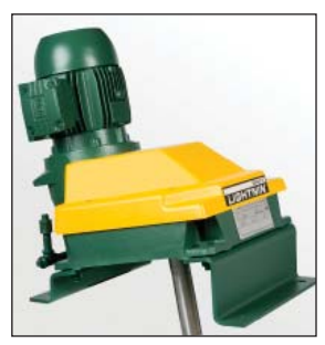
Optional angle riser brackets let you save up to 15% on tank costs by eliminating the need for baffles.

Our dry well construction removes the risk of lubrication leakage into the mixing chamber. The bearings are immersed in the gearbox lubrication which ensures that they continue to perform under high loads. Oil changes are made easy with our NEW tall pedestal which allows a 5 USGal. (20 liter) pail to be placed beneath the oil drain.