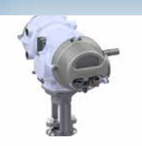
Complete range of automation capabilities, all actuator brands available.