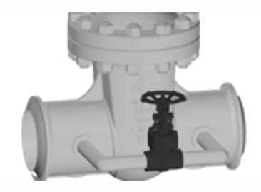
Optional by pass to optimize system and/or valve performance.