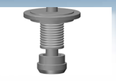
Stem Bellow sealing, free of maintenance and emissions. Environmental friendly. (Globe and Gate Valves)