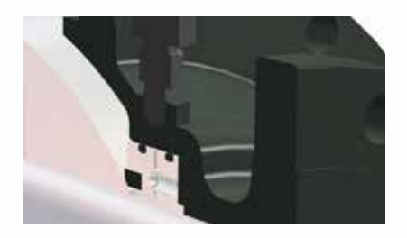
Double block and bleed and emergency sealant system. (Trunnion Mounted Ball Valves)