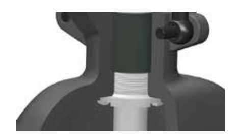
Backseat bushing which isolates the packing from flow exposure at valve open. (Globe and Gate valves)