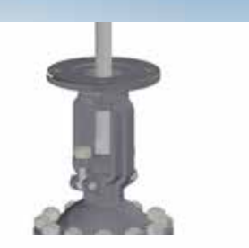
Optional with bare stem, for your personal actuator selection and installation.