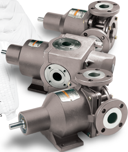
E1-Series: EnviroGear Seal-Less Internal Gear Pump