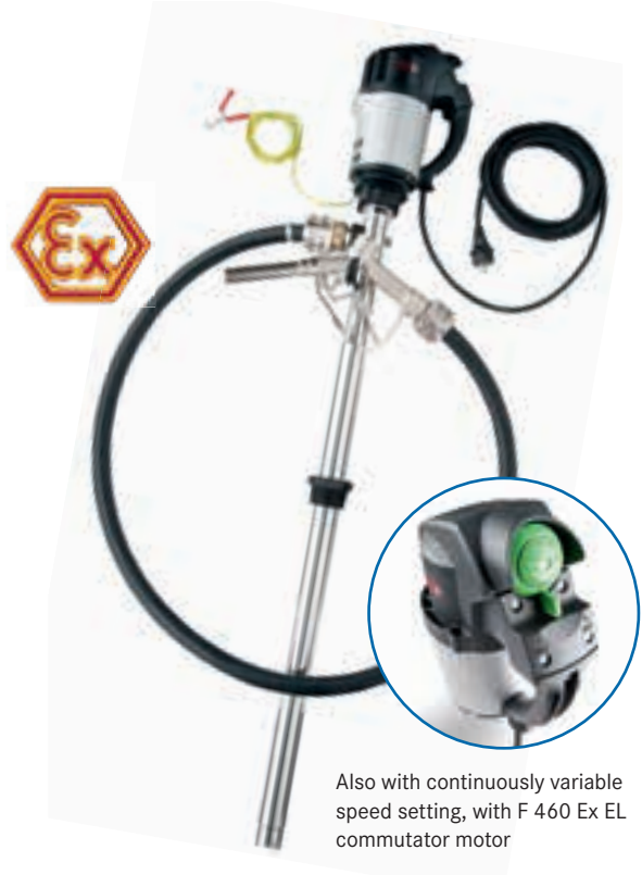
Also with continuously variable speed setting, with F 460 Ex EL commutator motor

When using the pump with hose and pump nozzle, the flow rate is max. 50 l/min.*, viscosity max. 800 mPas, temperature max. 100 °C (in areas subject to explosion hazards max. 40 °C), delivery head max. 13 mwc.