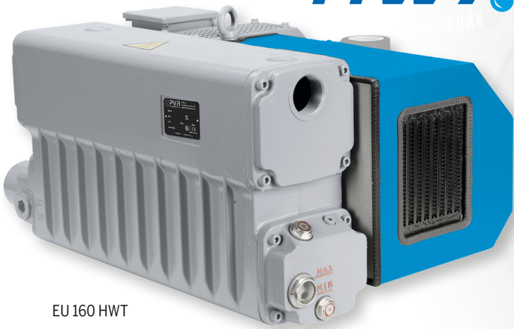
EU 160 HWT