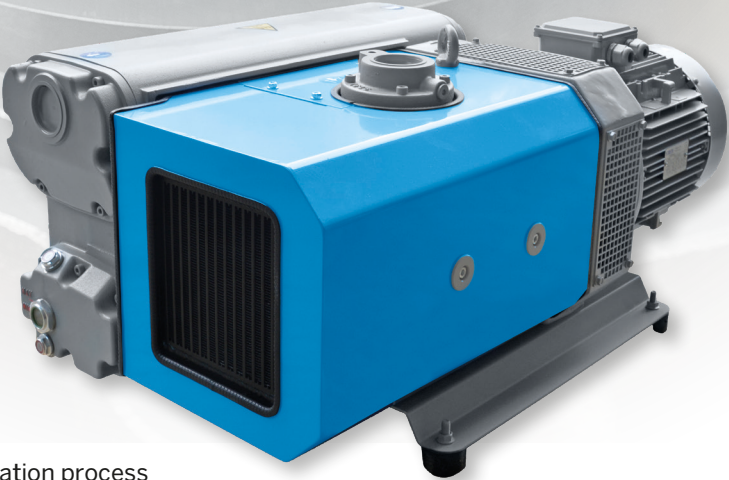
EU 300 F HWT